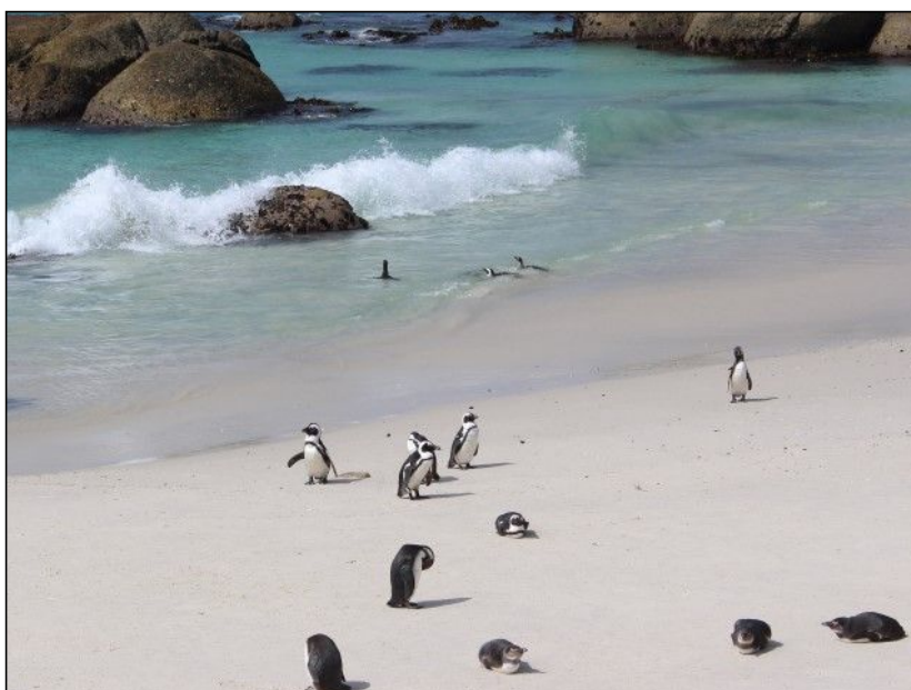
Penguins at Boulders