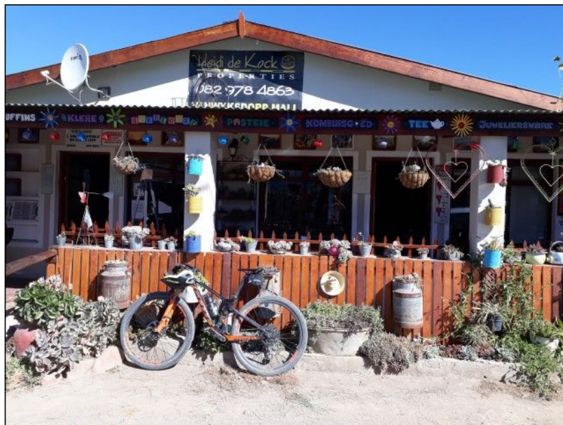
Karoo farm stall for lunch