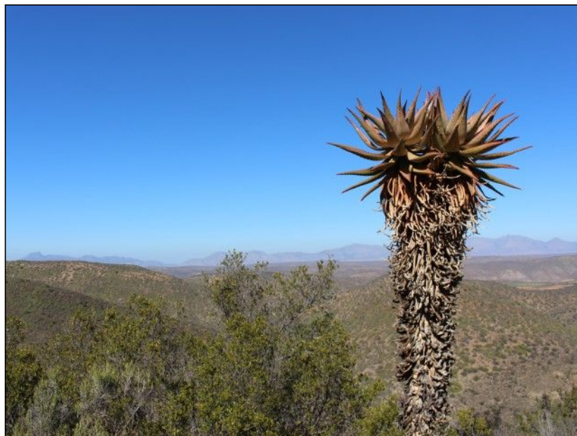
Little Karoo Aloe