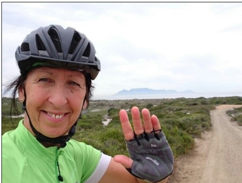
Ladies on tour having fun