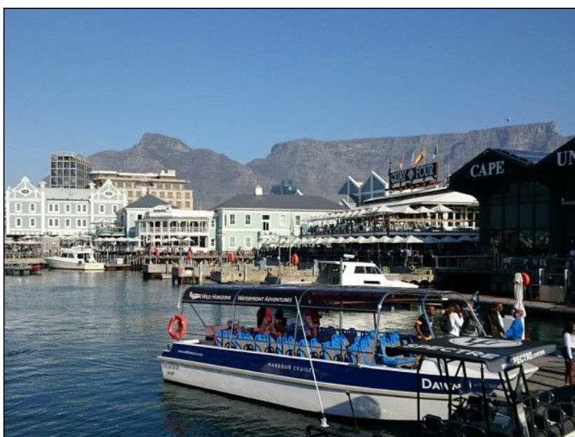
Cape Town waterfront