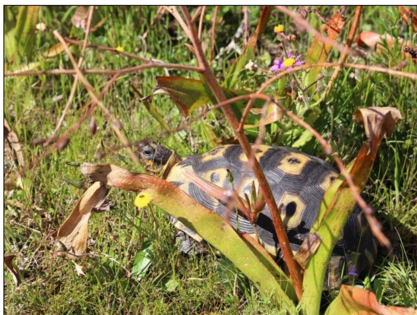
The little things count