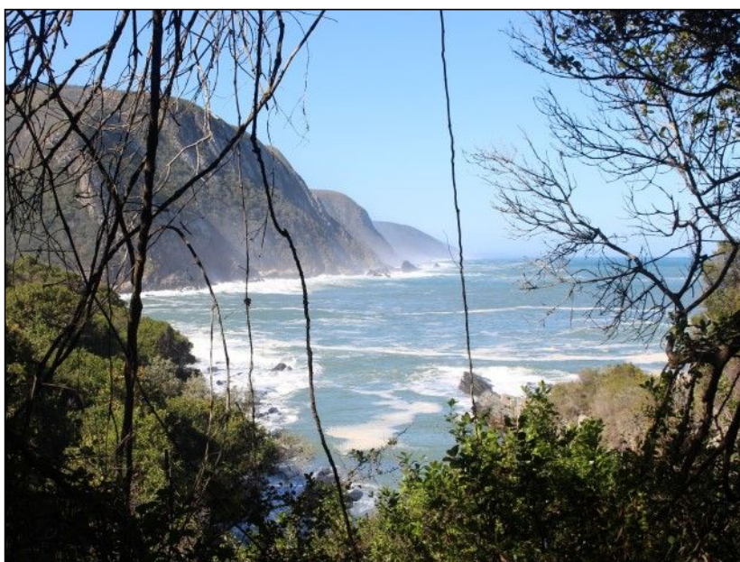
Tsitsikamma National Park