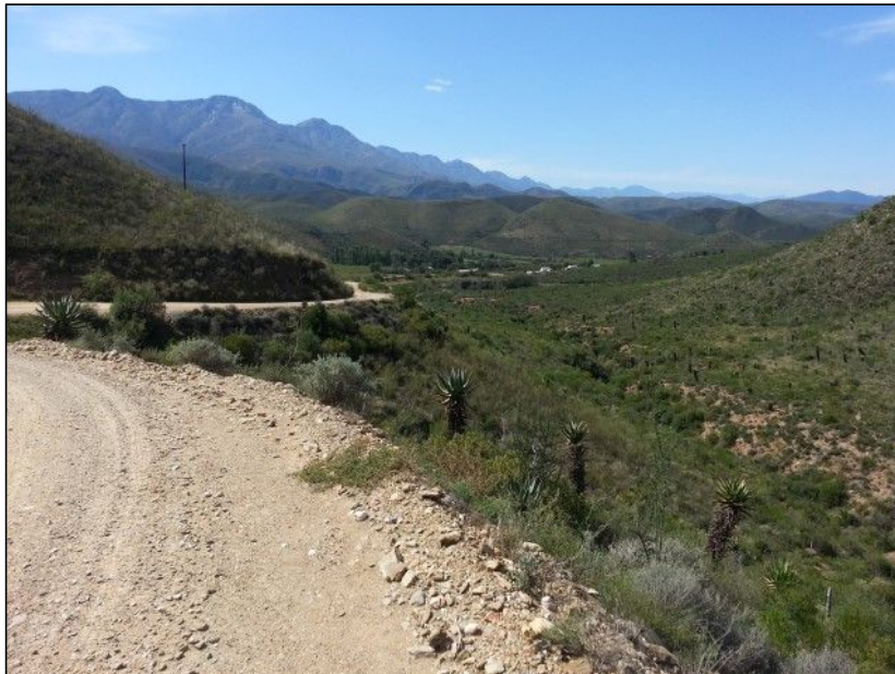
Wide open spaces