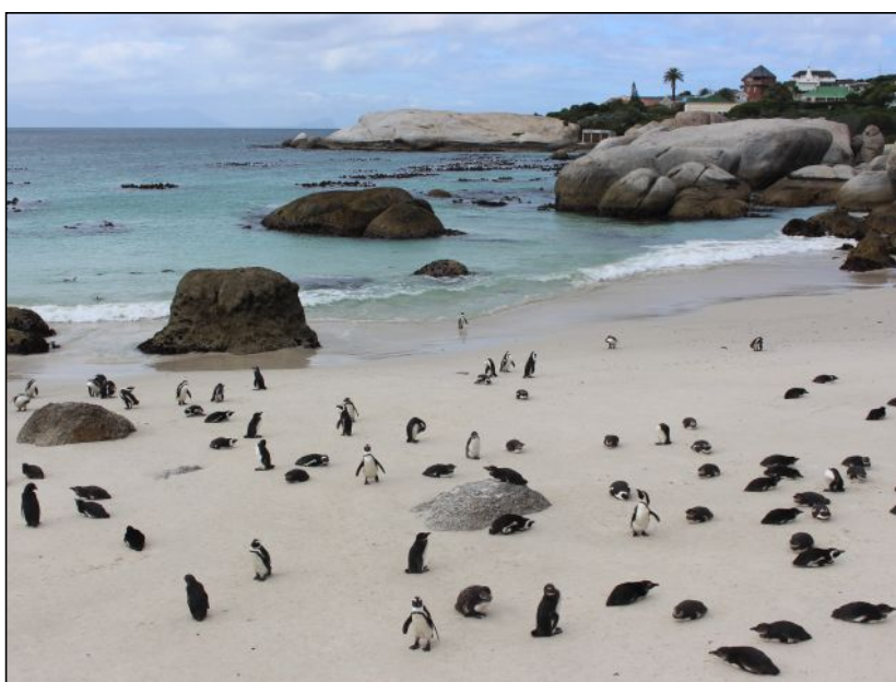
Penguins Cape Peninsula