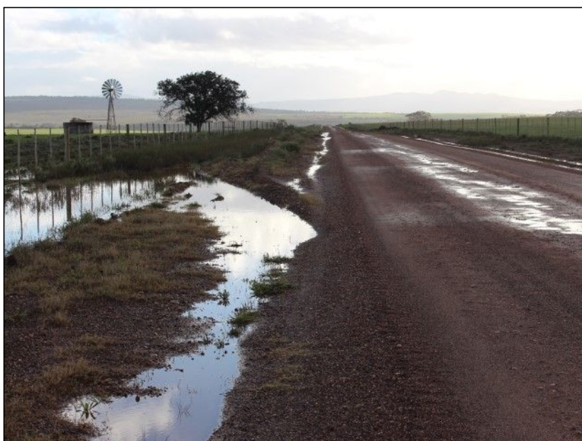
Little Karoo rain