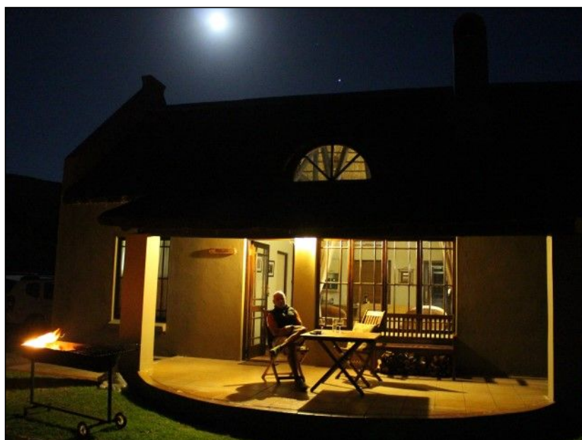
After a long day - Little Karoo