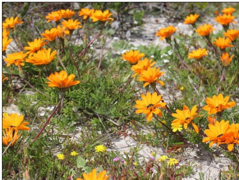
Spring in the Little Karoo