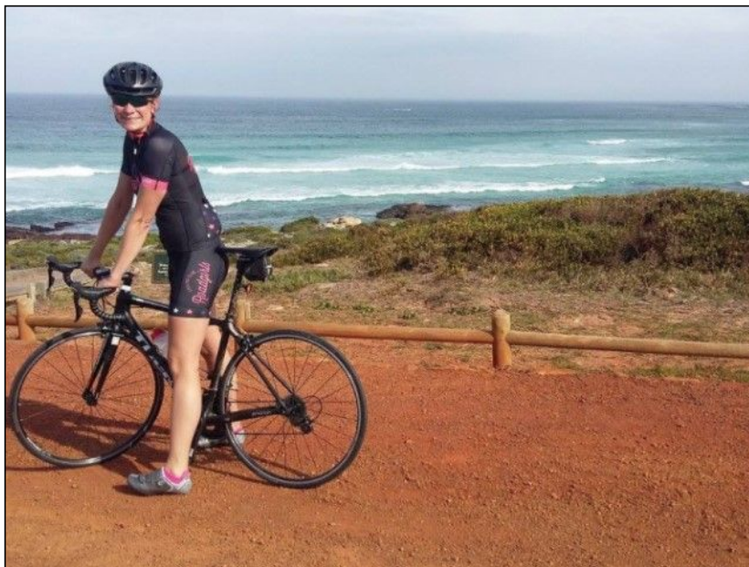
Cape of Good Hope