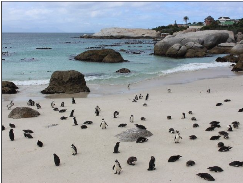
Penguins - Boulders Beach