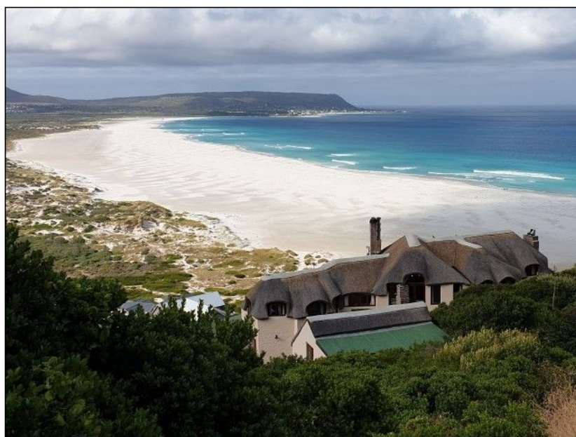
Noordhoek Beach view point