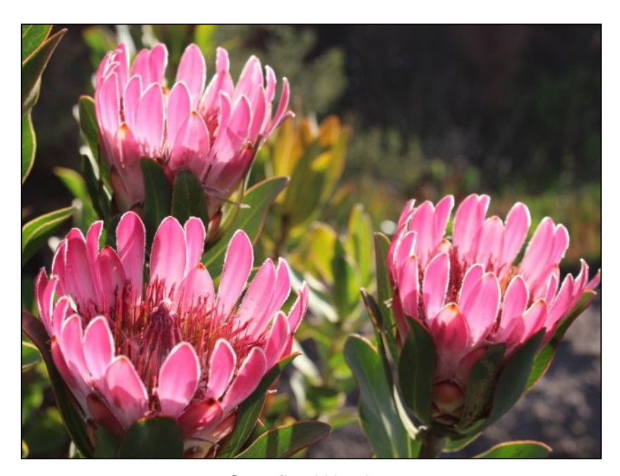
Cape floral kingdom