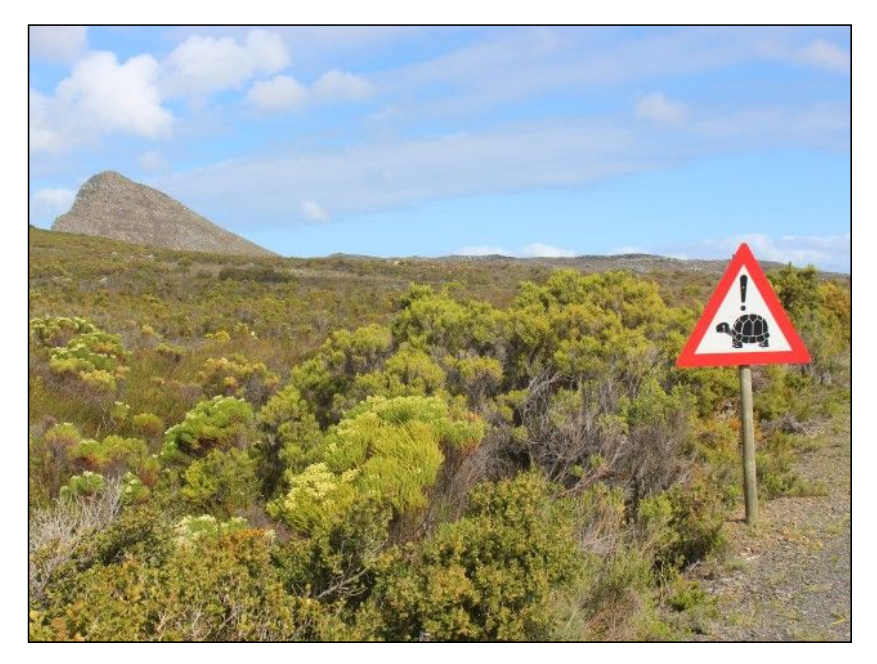
We stop for the small things