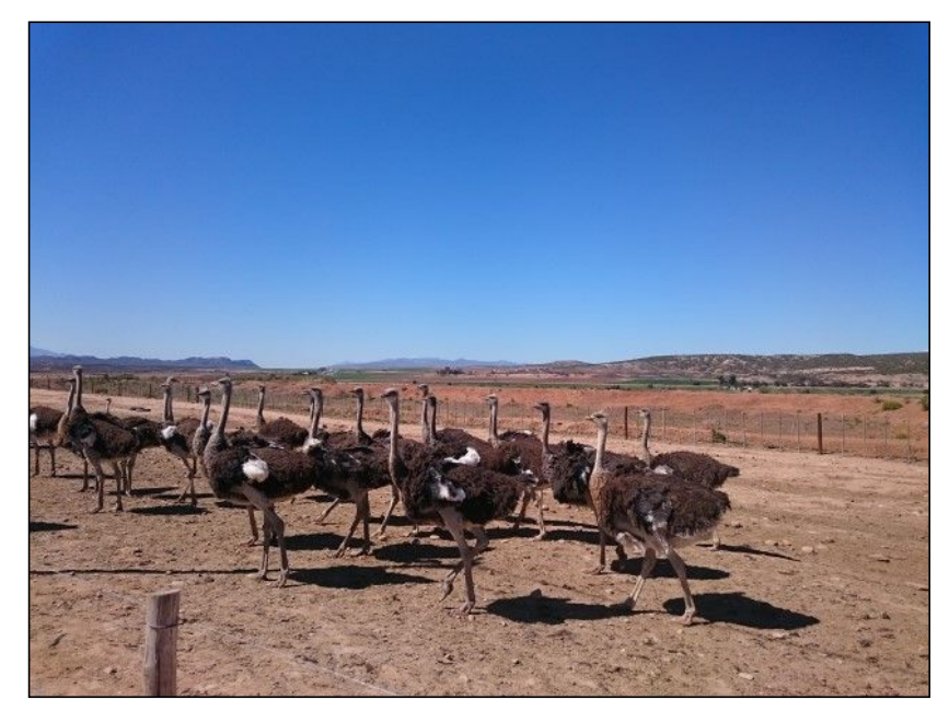
Birds of a feather - Oudtshoorn