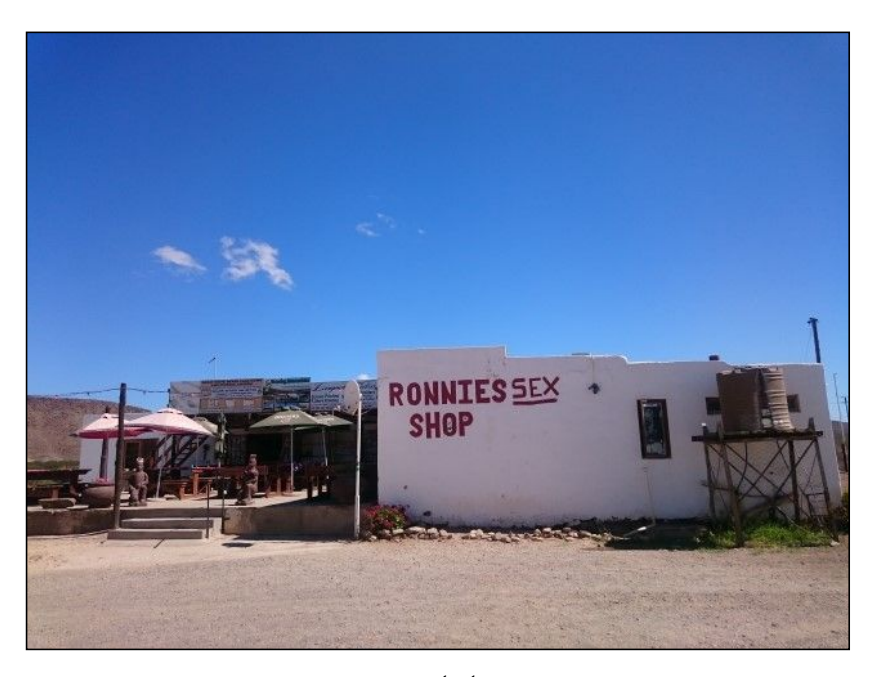
a must stop