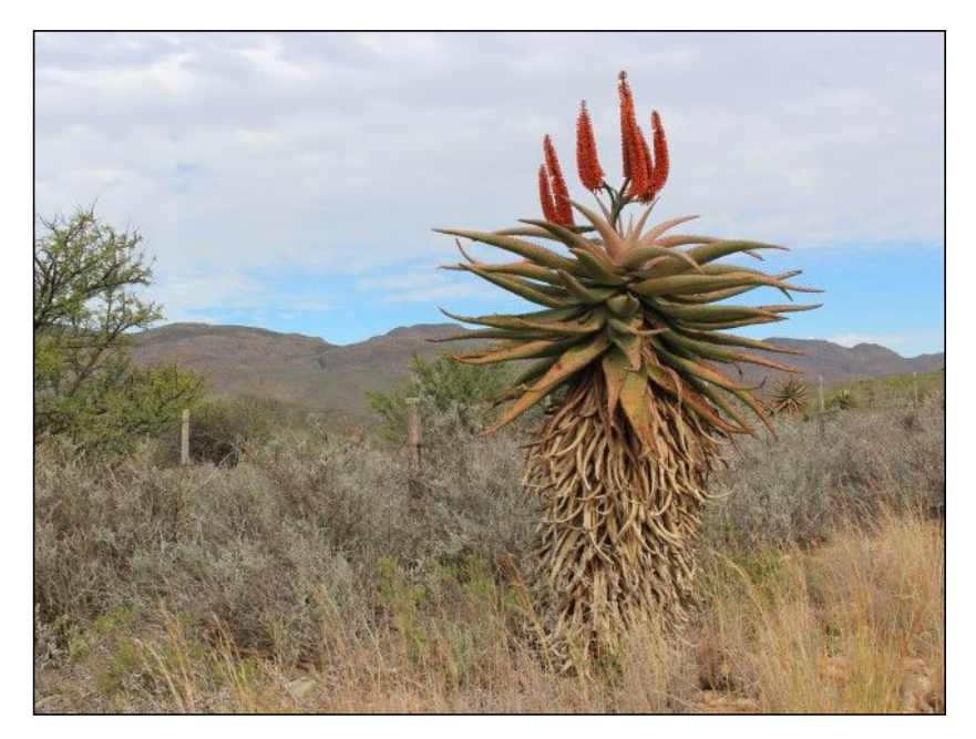
Aloe in the Karoo