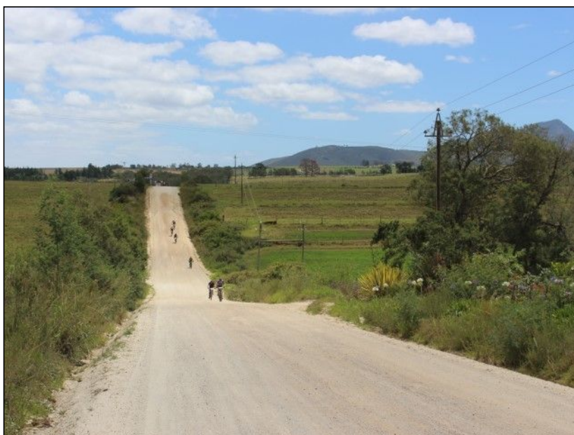
Garden Route country roads